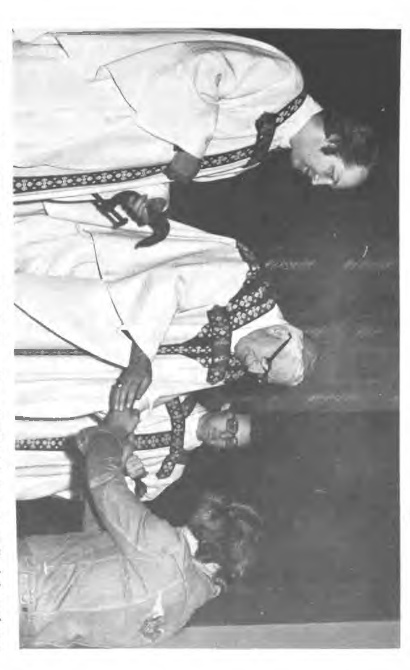
A clamp, wrench, and screwdriver are solemnly blessed by a Catholic bishop for an English worker as part of the Vatican's new policy of interpreting the Gospels in socialistic, if not Marxist, terms.