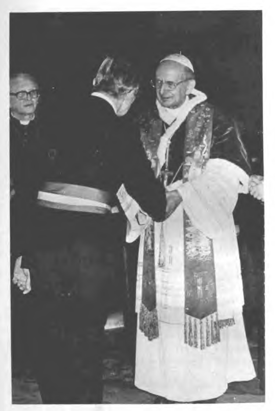
Pope Paul VI extends cordial papal greeting to the Communist mayor of Rome, following the latter's election in December 1976. The Pontiff urged Romans to cooperate with the Communist administration.