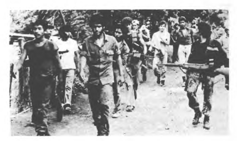
Well armed Sandinista guerrillas parade two Nicaraguan National Guard deserters through a dirt alleyway in Leon June 18, 1979.