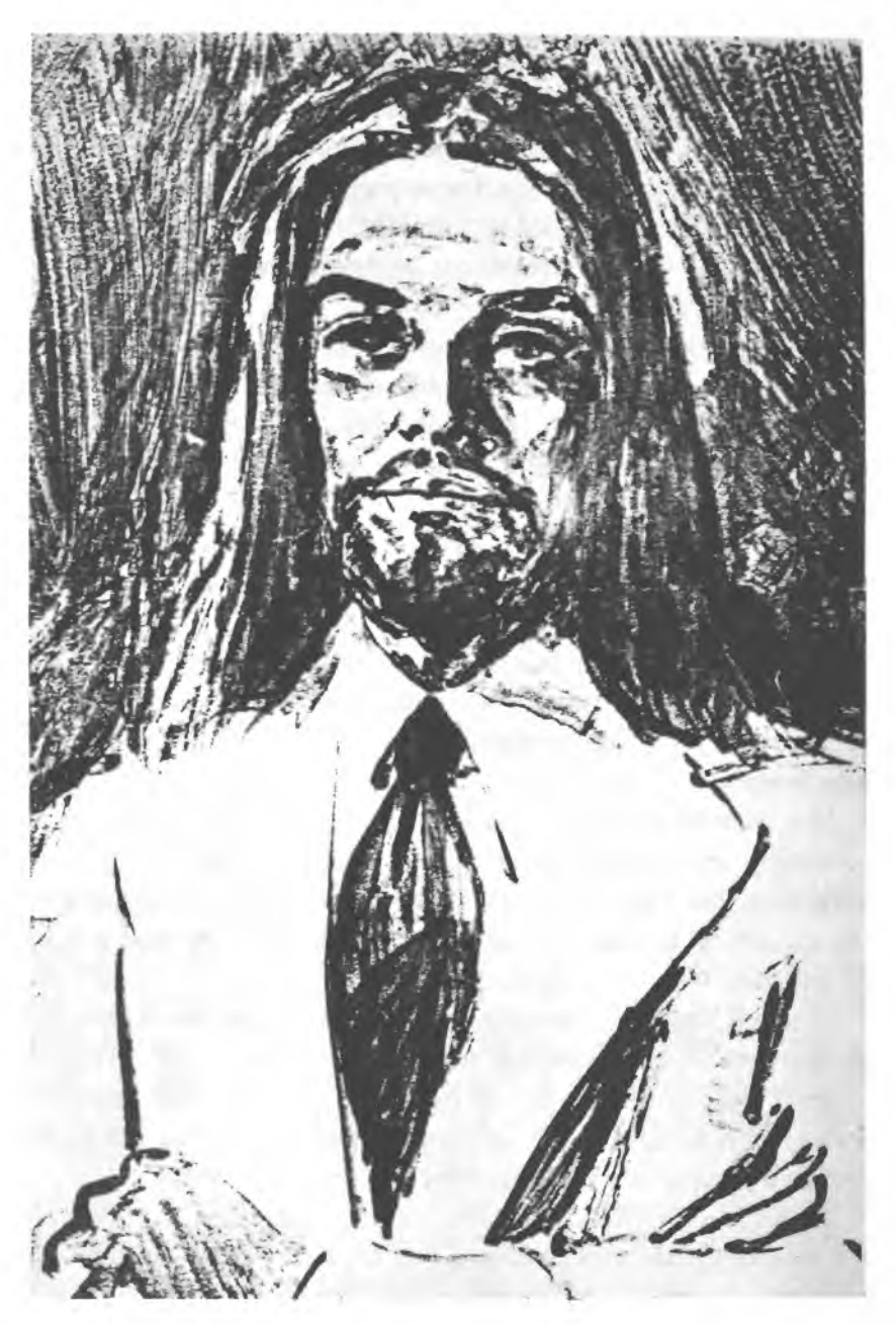
To identify itself with the expanding mass movement of the Left, the Catholic Church is fostering a new image of Jesus as a white-collar office worker or factory employee. Posters like the above are currently being displayed in Italy, France, and Latin America.