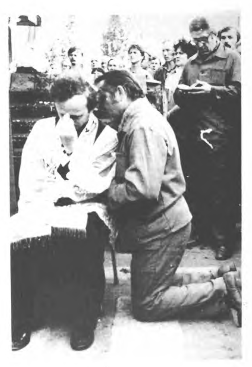
A striking worker confessing during the religious services in the Lenin shipyards in Gdansk, Poland August 24, 1980.